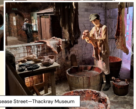
Disease Street—Thackray Museum