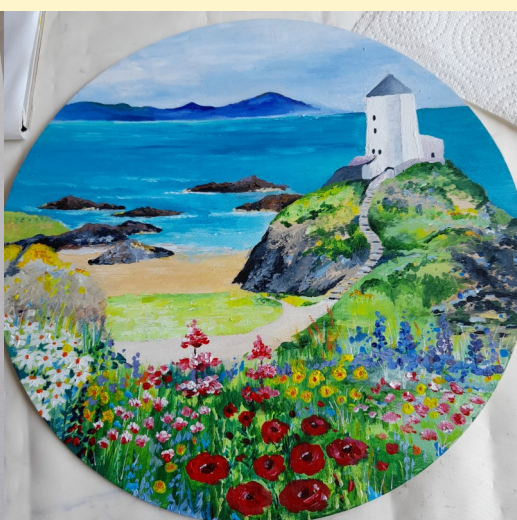
Seascape by Pauline Mullarky